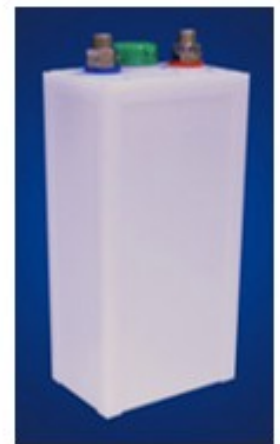
KGL200P KGL250P KGL300P