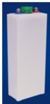
KGL100P KGL125P KGL140P