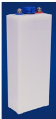
KPL100P KPL110P KPL125P