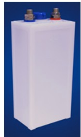
KPL200P KPL220P KPL250P KPL275P