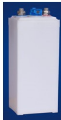
KPL140P KPL160P KPL180P